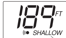
"SHALLOW" icon Figure 4

After your selection is made, the unit will return to normal operation after 5 seconds. The "SHALLOW" icon should now be visible (Figure 4).