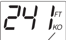
Figure 13 Keel Offset icon

To enable Keel Offset press SET until the KO icon is displayed on the screen. The default setting of the unit is off which is displayed as zero. From the default setting of 0.0, use the DOWN arrow to enter the negative (-) number to set the unit for depth from the keel. Or, from the default setting of 0.0, use the UP arrow to enter a positive (+) number to set the unit for depth from the waterline.